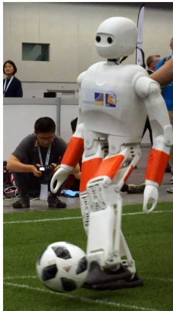
Fig. 1. The NimbRo-OP2X robot.

{ pavlichenko | ficht } @ ais.uni-bonn.de http://www.nimb-ro.net