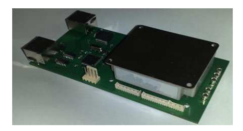
Fig. 3. Archie: Brushless Notor Driver