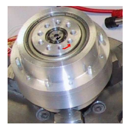
Fig. 2. Archie: Modular Joint Design combining a brushless motor and a harmonic gearbox

In Archie we are using three types of motors: brush-less motors, DC motors and RC motors. Some of the key benefit of using a brush-less motor in Archie are increased efficiency and less noise of the motor. However, control of a brush-less motor requires more complex control logic, but allows for finer control. Given those advantages it would have been sensible to use only brush-less motors for Archie, but to save cost, the joints that do not need to generate very high torque were implemented via DC motors.