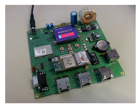
Fig. 5. ARCHIE: Spinal Processing Unit

The SPU also provides internal diagnostics and fail-safe tests to make sure that he robot's operation is safe.