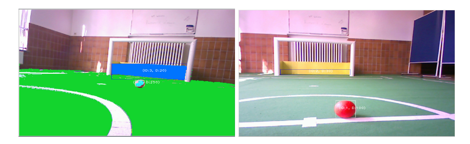
Fig. 2. Color Segmentation and detected Objects

Our perception aim is to locate objects as well as an amount of marks on the field. Because we use a stereo vision, we are able to calculate the distance to the object very accurately. By scanning the picture with an speed-optimized Scanline-algorithm with color-segmentation, we can detect or estimate the colored object positions and distances in few cycles. Using this information we can only process these preprocessed segments of the image, using windowing. The algorithm is able to detect just objects on the field to reduce errors caused by false detected colors surrounding the field. We are using the YUV image format, that supports a detection of colors with different light intensities. The Stereo processing algorithm uses both camera frames to calculate the image disparity. the disparity is used to estimate robots distance to the object.