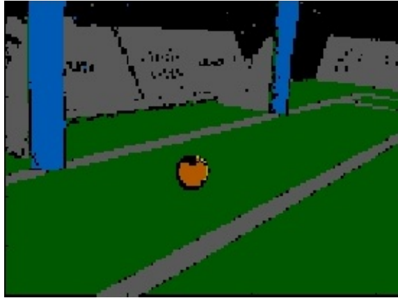
Fig. 4. Visualization of the color segmentation

greatly speed up the computation of the system. The bit OR-ed image also produced the set of points that are used in our line detection algorithm.