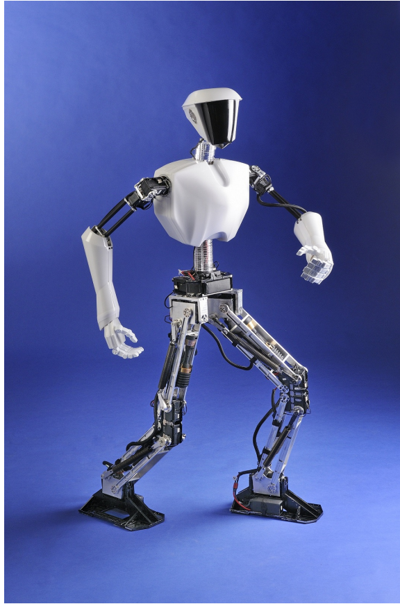
Fig. 1. CHARLI (Cognitive Humanoid Autonomous Robot with Learning Intelligence)

exchanging potential energy and kinetic energy of the system like the motion of an inverted pendulum. Humans fall forward and catch themselves with the swinging foot while continuously progressing forward. This falling motion allows the center of mass to continually move forward, minimizing the energy that would reduce the momentum. The lowered potential energy from this forward motion is then increased again by the lifting motion of the supporting leg.