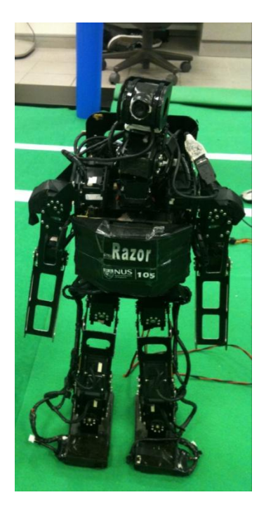
Fig. 1. RO-PE-VI in its standing position

For a robot to be fully autonomous, it has to contain its own processing unit and sufficient sensors to identify the surroundings. The primary sensor for RO-PE-VI is the one "pan and tilt" camera mounted above the chest. The camera is in compliance with the 2010 rule changes regarding the camera configurations allowed. Fig. 2 shows the components on RO-PE-VI while Fig. 3 shows the connections between these components.