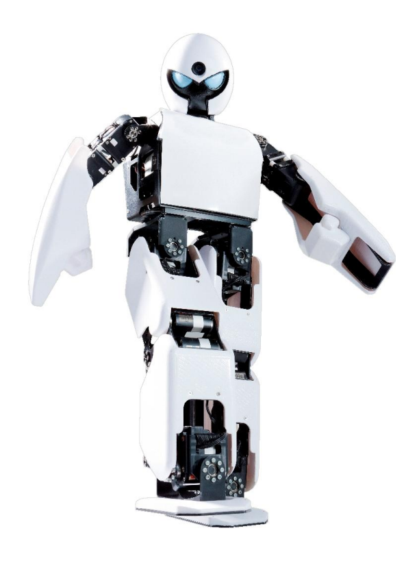
Fig. 1. REJr-2011, the latest version Robo-Erectus KidSize.

structure in the leg that increases the number of joints but simplifies the locomotion manipulability (See Table 1).