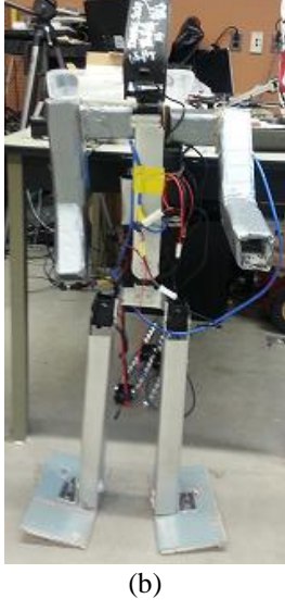
Figure 1: (a) "AUTeen" TeenSize Platform Design (b) "Scrappy" TeenSize Platform