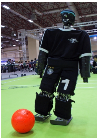
Fig. 3. NimbRo TeenSize robot Dynaped.