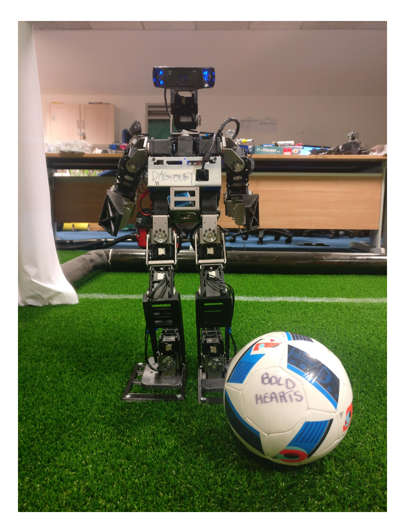
Fig. 2: An example of the new platfrom "Boldheart 2": It has been assembled with a new computational unit (Odroid-XU4), a new camera (Logitech HD Pro Webcam C910) and self-designed torso, feet, arms, legs and a head.

We are currently lengthening legs and arms to help standing up and walking better in response to previous changes. Examples can be seen in Figure 1. Also,